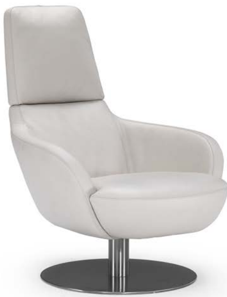
■ vers. 003