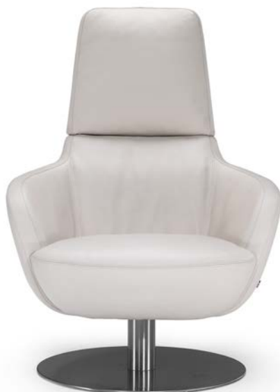
■ vers. 003