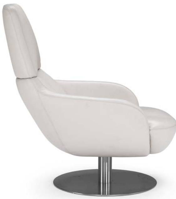
■ vers. 003